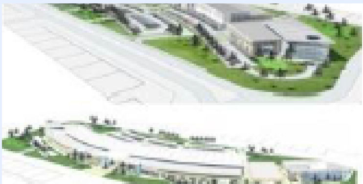
Eshbleeya Neighborhood Center (MPW)