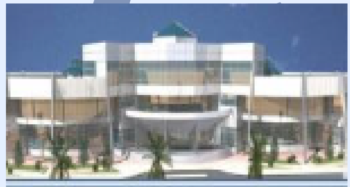
Social Security Building at Ahmedi (PIFFS)