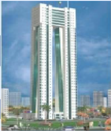
Twin Tower (PIFFS)