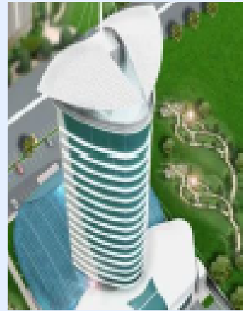
Wafra Commercial Mall at Salmiya