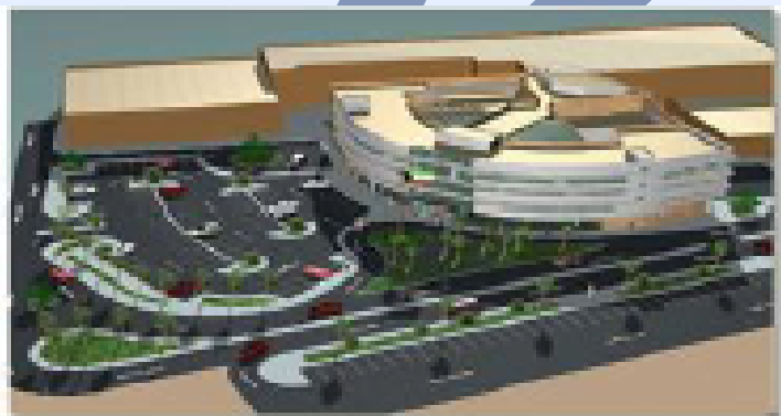
Ghanima Ahmed Alghanim Center for premature & genetics